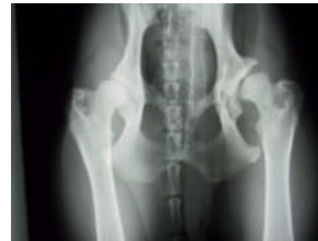
Severe Hip Dysplasia